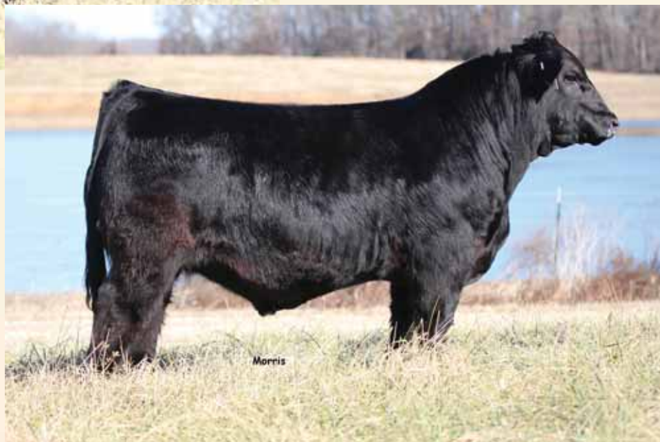
LOT 2: LVLS Don Julio 2149D