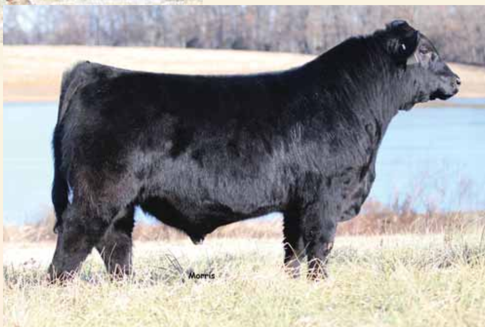
LOT 14: LVLS Denali 8213D