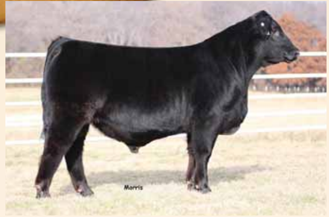
LSTO Best Effort 4833B