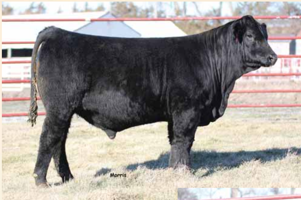
LOT 6: LVLS Drago 1015D