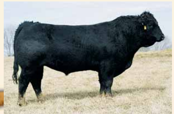
LVLS Top Criteria 8862P