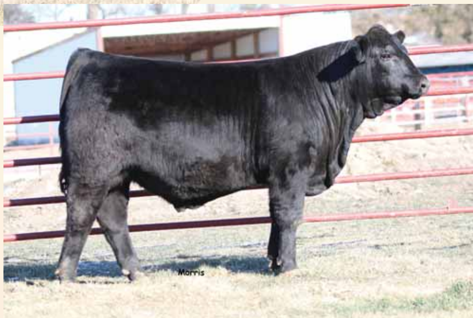
LOT 7: LVLS Maximizer 1037D