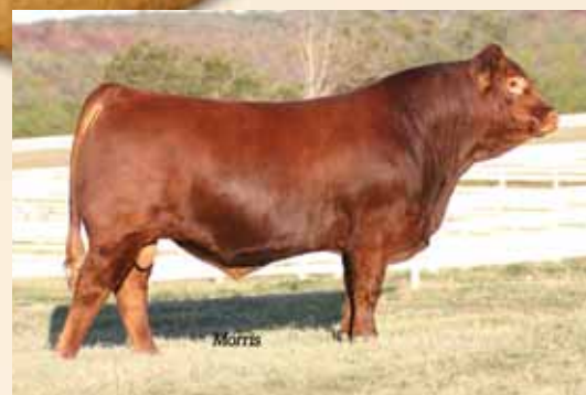
PBRs Equinox 161Y