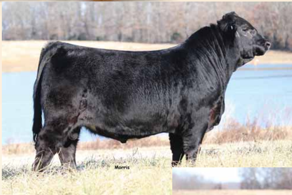
LOT 1: LVLS Devil's Advocate 1036D