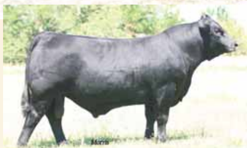
EBFL Ypsilanti 420Y