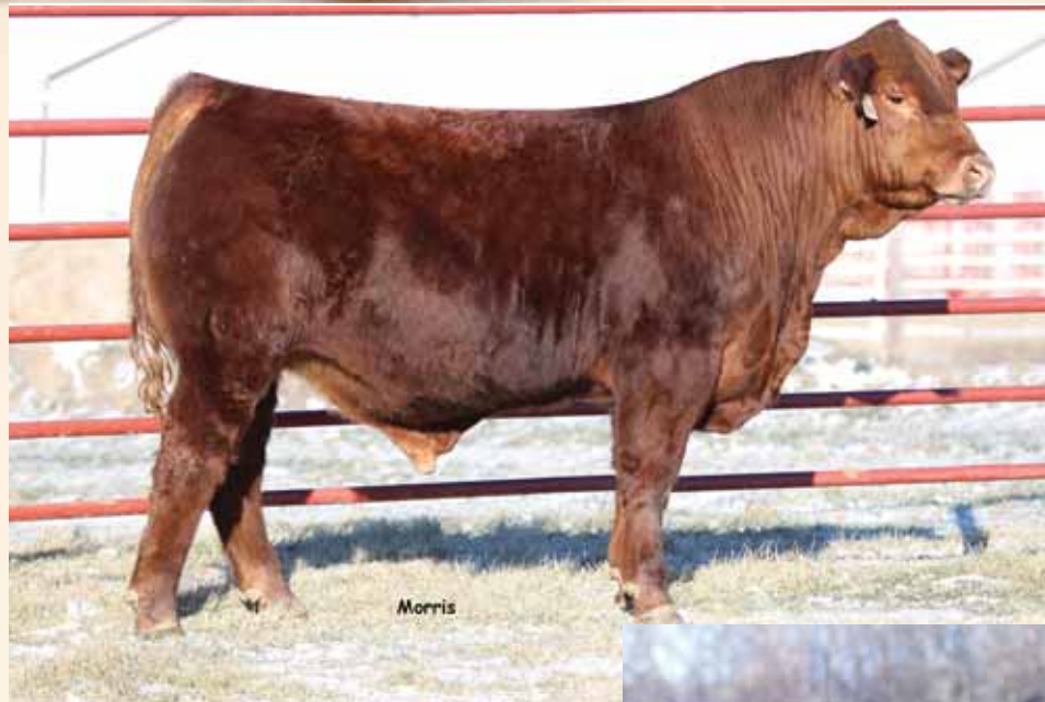
LOT 13: LVLS Dispatch 718D