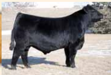
ADLL Axi 3007A