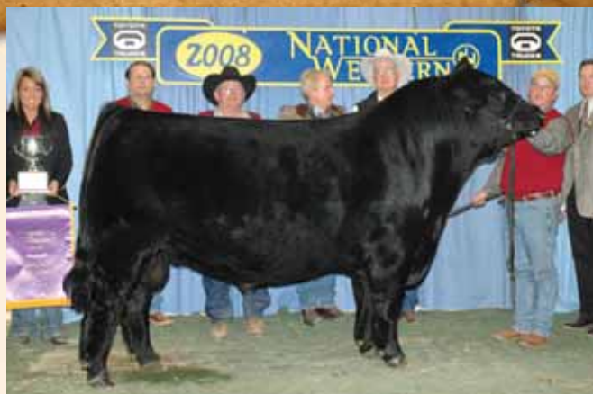
DHVO Deuce 132R