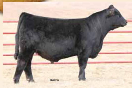
LVLS Bank Account 8116B