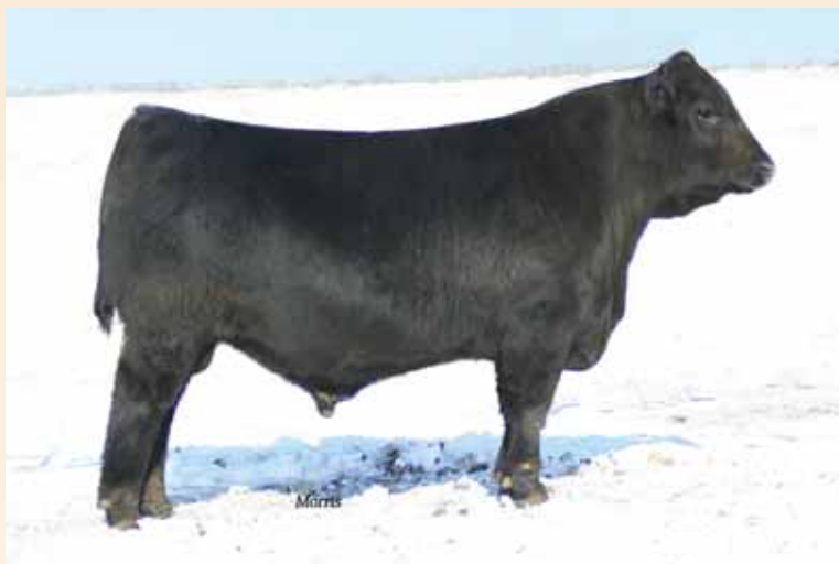
LVLS Focus 5047Y, sire of Lot 80.