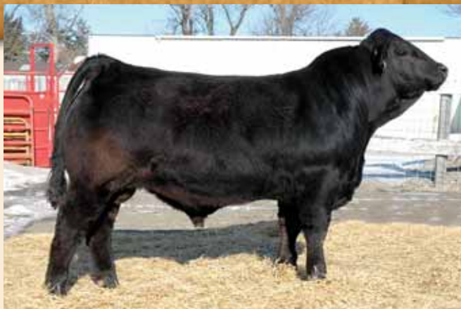
LVLS X-tra Profit 2014