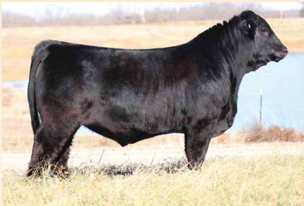
LOT 3: LVL5 Duff Man 6736D