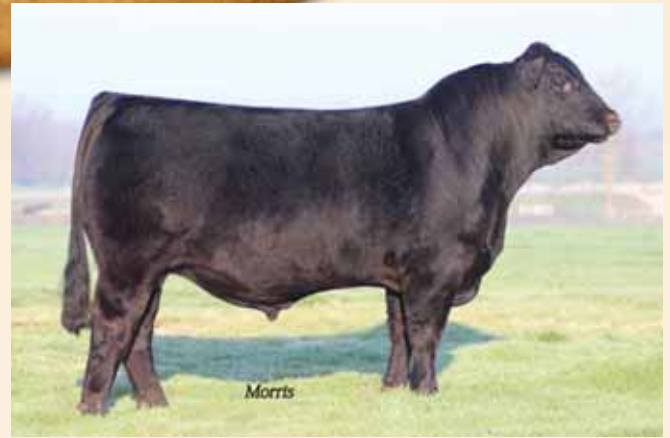
MAGS Zenith, sire of LVLS Bourbon 1069B