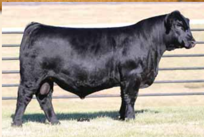
AUTO Heavy Duty 174A